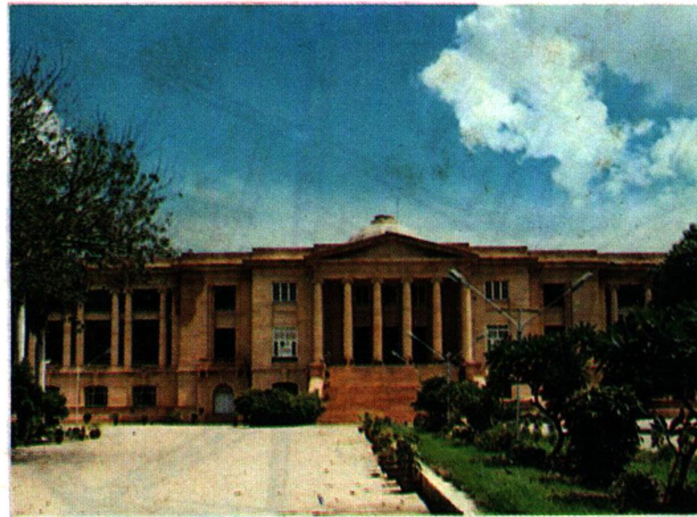
Sindh High Court

Time: The most suitable time, to avoid the peak hours traffic rush, is as follows; For Route "B" the recommended time is early morning between 6.00 to 7.00 a.m., while estimated time for this tour is an hour to one and a half hour. The estimated duration of Route 'A' is approximately two and half to three hours if all the buildings are viewed including detour 1 and detour 2. This tour can be started at 7.00 or 7.30 a.m.