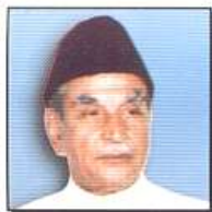
Hakim Mohammad Said

One of the greatest social reformer of our age, whose initiatives transformed the lives of millions of people.