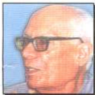
Dr. Akhtar Hameed Khan

These are people who went much beyond the needs of their professions to meet the urgent requirements of a nation in turmoil. They did not wait for any messiah of change. They became their own vehicles of change.