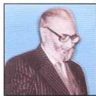
Dr. Abdus Salam

A businessman, who, against the prevailing business ethics of our nation, chose to invest his profits within the community and in the national development process.