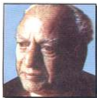
Faiz Ahmed Faiz

A scientist who reached the pinnacle of his profession, and strove for the development of the under developed world.