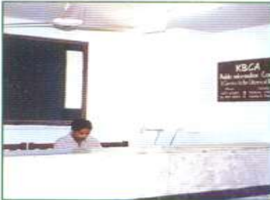
Public Information and service counter at KBCA Civic Centre.

1100 acres in Trans Lyari Gutter Baghicha Saved