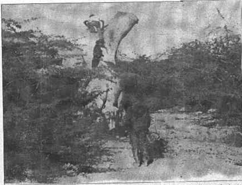
This is just a partial view of one of the banyan trees of Wateji. There were several like this. Now even the stumps are gone. The orchard was cut down upon instructions of the Union Government, Thail. To me this stumps looks like the headstones of a tomb. Climbing it is heritage.

The name would arouse the curiosity of anyone with imagination and a smattering of history. I decided to investigate. Jeeps were few those days and we thought it best not to risk the car across the