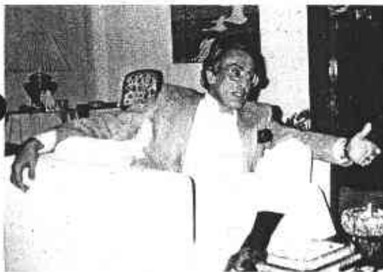
Sindh Chief Minister Syed Muzaffar Hussain Shah photographed at his residence.

'SHEHRI' interviewed Syed Muzaffar Hussain Shah when he was Minister for Law and Parliamentary affairs.