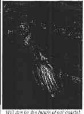
Will this be the future of our coastal creatures?