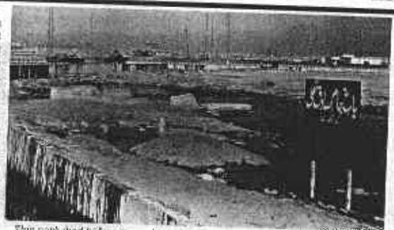
This park died before it was born due to contaminated ground water from nearby tanneries

show high concentration of Antimony. But a recent analysis of the same waste samples taken by the EPA Sindh, and carried out by