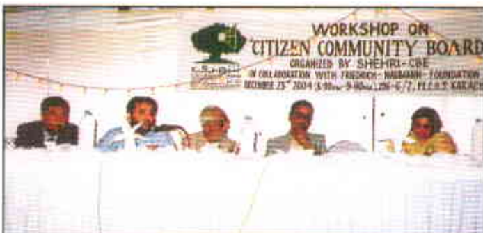
Launching of Zimmedar Shehri