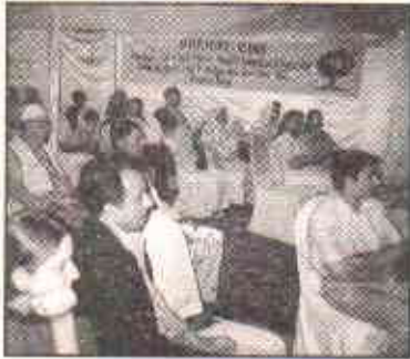
Mobilizing the citizens

environment, including but not limited to those aspects related to local/governmental representation and administration, crime control environmental pollution, community welfare, local/governmental fiscal control and taxation, health care, building contraction and control, land development and all other matters of civic concerns.