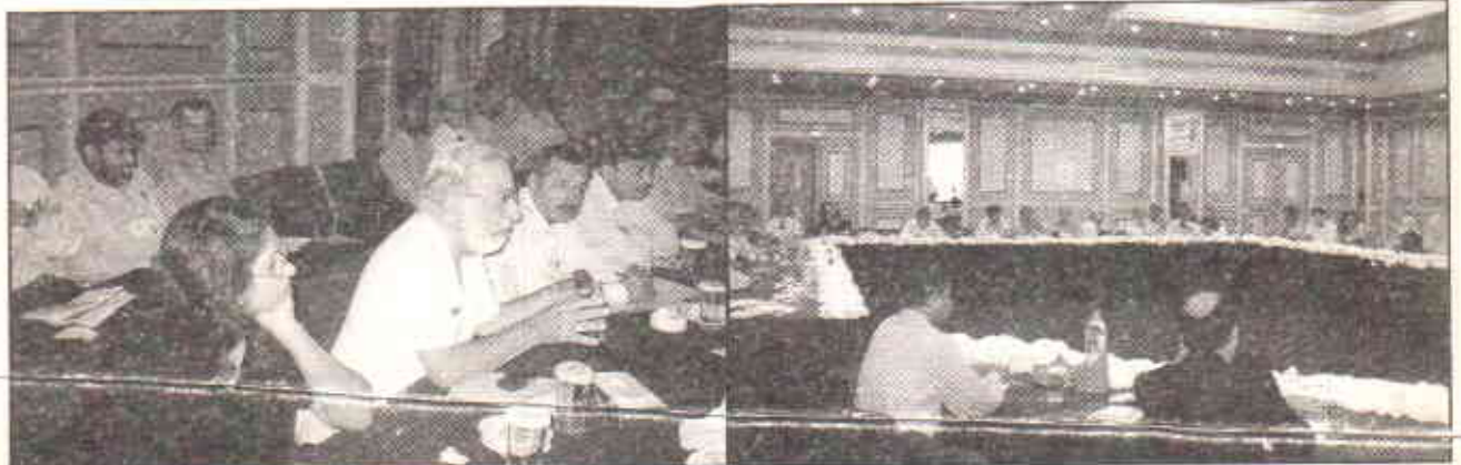
A number of stakeholders participated in the seminar