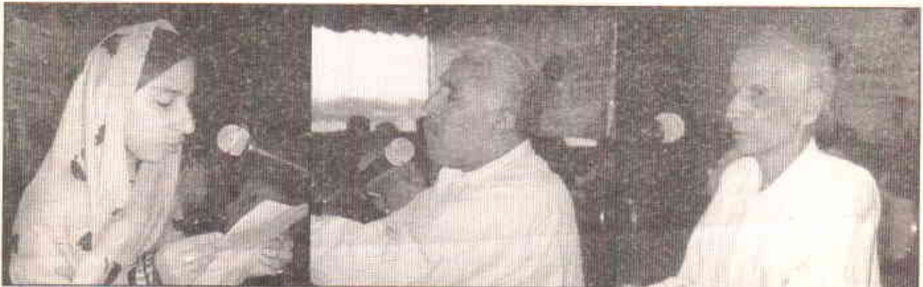
A number of eminent speakers participated in the seminar

However, the meeting suggested that surplus land at the project site should be reserved for the rehabilitation of displaced persons of the Lyari expressway project. □