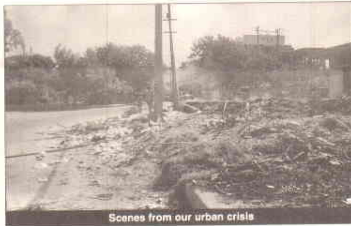
Scenes from our urban crisis

Control of administrative, legal and financial levers is in the hands of government. Diffusion of political and administrative leadership has led to case by case external intervention by the government bureaucracy, pressure groups and politicians. There is