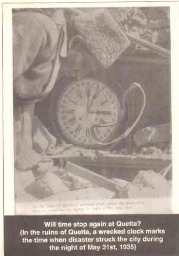
Will time stop again at Quetta? (In the ruins of Quetta, a wrecked clock marks the time when disaster struck the city during the night of May 31st, 1935)

pletely destroyed Quetta city. After 1935 earthquake, it was realized that future construction should be designed to withstand, expected seismic forces. Therefore, the Government of Balochistan prepared and enforced, a Building Code in 1937 to regulate the construction of private buildings within the limits of Quetta Municipality. This code recommends adoption of a seismic factor of G/8 (0.125 g) along with the recommendations, requiring specific type of construction and materials."