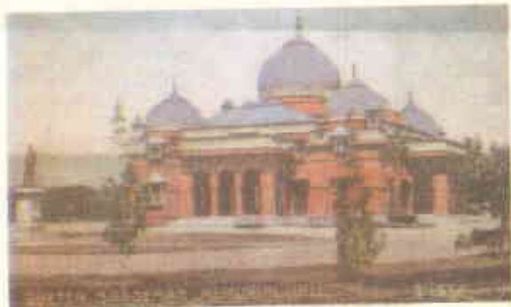
Faint, illegible text located below the photograph of the building.