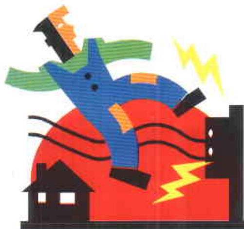
Electrocuting the consumers!

kunda connections, bypassing or tampering with meters etc.