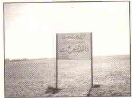
Gone are the mangroves!!