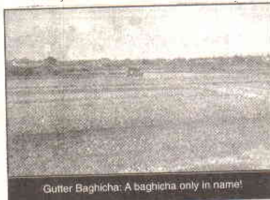
Gutter Baghicha: A baghicha only in name!

Later, the operation was abruptly halted following a meeting of a group of industrialists with the provincial governor. The industrialists urged the government to suspend the operation for a month. The operation was halted immediately on the directive of the gover-