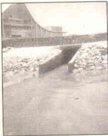
A convenient solution?

made its own channel, cutting across the beach, into the sea. At high tide, sea water and sewage become inseparable. This is truly an appalling state of affairs and we at Shehri-CBE would appreciate a few answers from the concerned authorities;