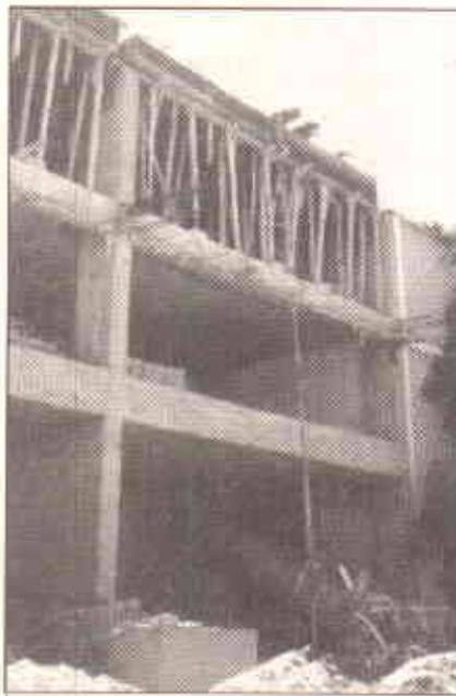
The rapidly changing face (for the worse?) of Karachi