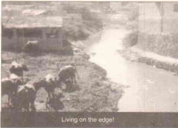
Living on the edge!