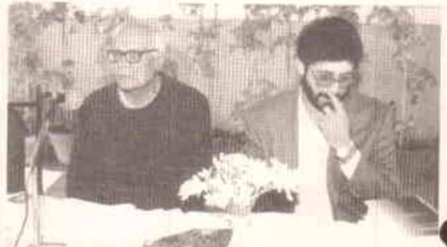
(L-R) Dr. Akhtar Hameed Khan (Chief Guest) and Qazi Faez Isa (Chairman, Shehri-CBE)

The day workshop was split into three separate sessions. The inaugural session was followed by two working sessions. Dr. Akhtar Hameed Khan , the noted social worker and founder of the Orangi