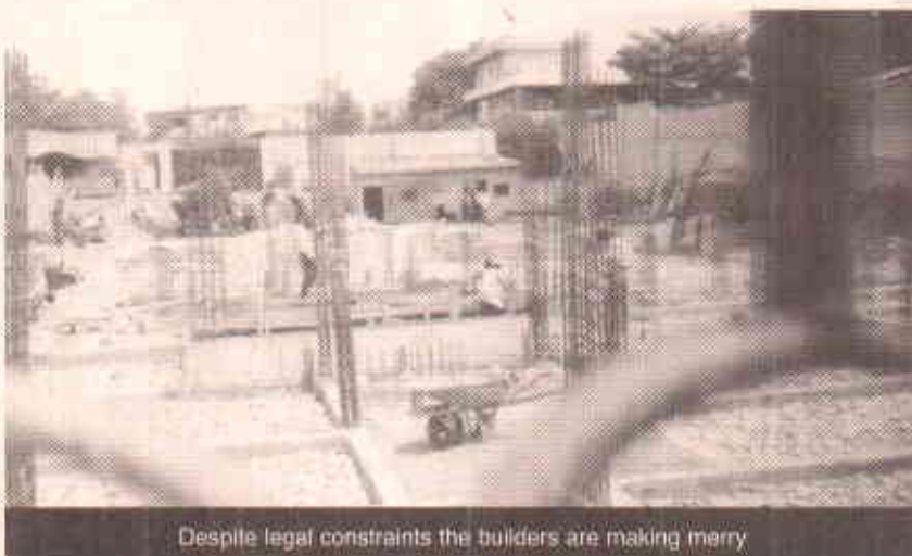
Despite legal constraints the builders are making merry

sharp decrease in this contemptuous and elaborate "noora kushti" game that is played by the builders' mafia and their partners in the KDA/KBCA, the Divisional/District Administrations, the Police - and many others who cannot be named! □