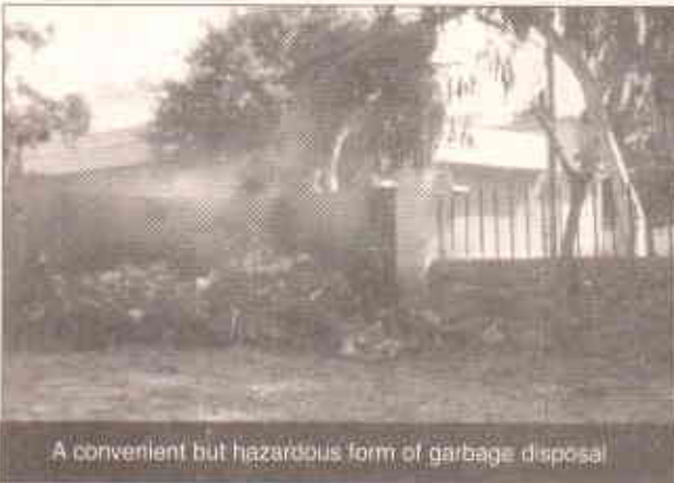
A convenient but hazardous form of garbage disposal