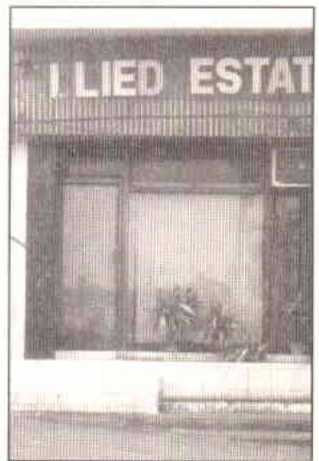
A picture is worth a thousand words!