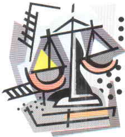
The scales of justice go topsy turvy!!

The Sindh Building Control Ordinance, 1979 was promulgated on 3rd March 1979 to provide for regulation of the planning, construction control and demolition of the buildings. The Karachi Development Authority Order, 1957 was promulgated on 13 th December 1957 with a view to inter alia "opening up congested areas laying out or altering streets, providing public amenities like parks gardens and playgrounds, executing works for water supply and sewerage or by demolishing, improv-