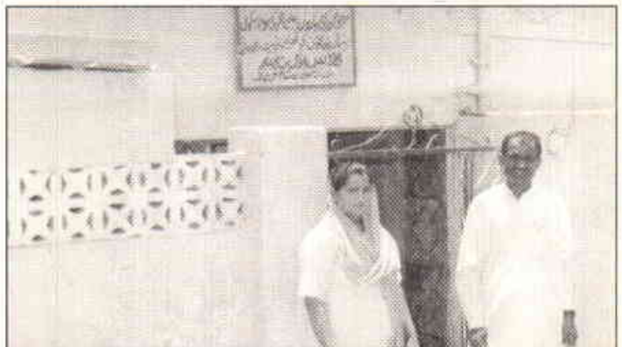
A Shehri supported school in Korangi

called after this in the second week of Ramzan, Wednesday, December 5th 2001 at 9 p.m. Present at the meeting were the Nazim/Naib Nazim / Lady Councilors and male councilors, of UC # 1 Akhtar Colony, Jamshed Town. It was discussed that work will be done in co-ordination with Shehri-CBE administrator and other members of Shehri who are in the education field, with the councilors who have been entrusted with the monitoring of schools in their areas of jurisdiction. It was decided that each school will be visited in turn and details of requirements noted down, number of staff/pupils/quality of education imparted/ and type of motivation required to be done.